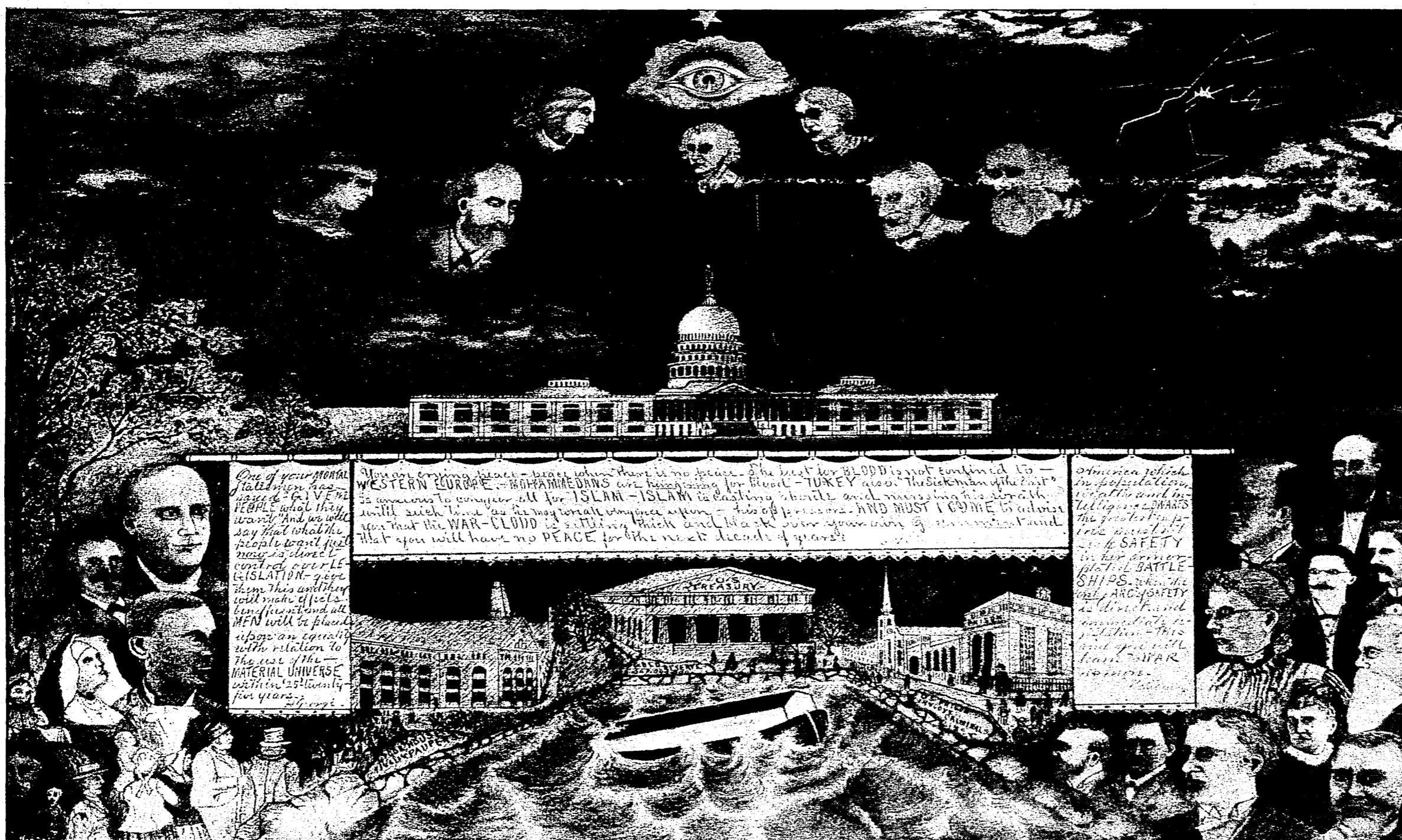
THE IMPERILED REPUBLIC—A Prophetic Spirit Picture.