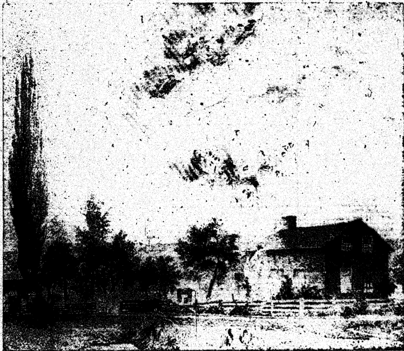
The Home of the Fox Family, the Birthplace of Modern Spiritualism.