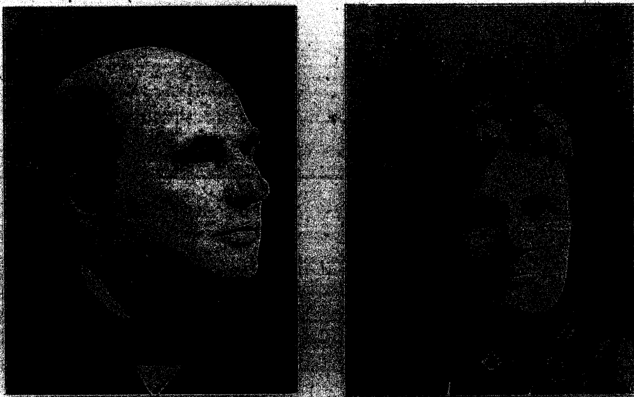
TWO OF OUR MISSIONARIES.

In the struggle for emancipation he makes many serious mistakes, in the eagerness of his desire for power and knowledge, he is more often cruel and selfish, than humane. The operative power in man is good, but the expression of that power through undeveloped souls, is often anything but spiritual