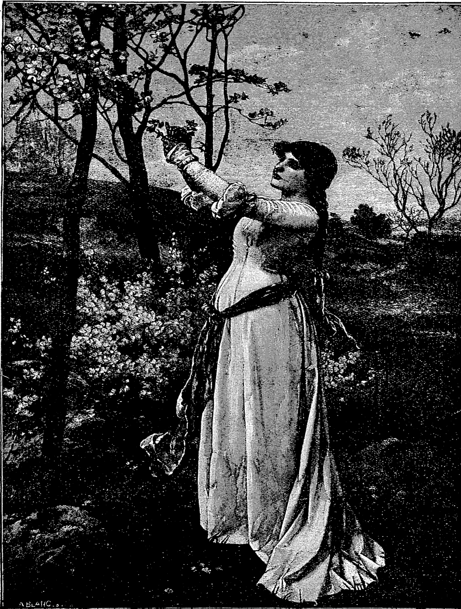
APRIL SHOWERS BRING FORTH FLOWERS. A TYPICAL CALIFORNIA SCENE.

That is just what we demand of the few scattering Spiritualists throughout this country, and it is a method that is holding back the great wave of progress that would otherwise ensue.