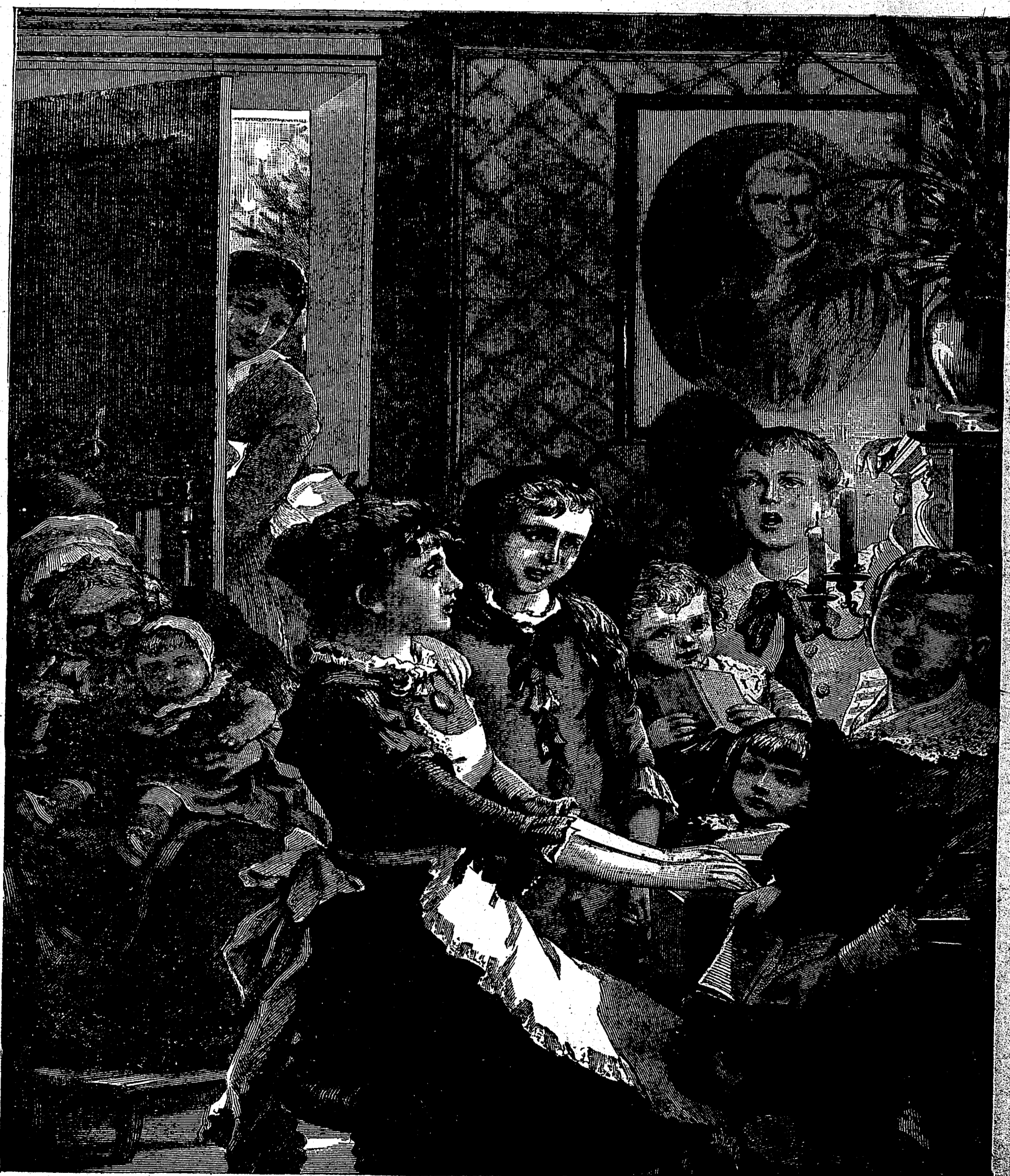
A New Year's Party—1902.

lightly upon it. After a brief interval passed in ordinary conversation, the hands of the medium beat rapidly upon the table, she seized the pencil and began to write slowly and laboriously, as one unaccustomed to the use of a pen.