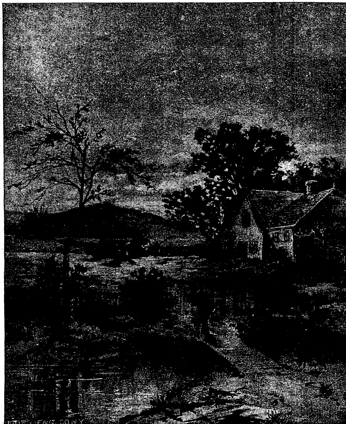
Country Scene in England.

Now, Home, like other mortals, had his peculiarities, one of which was a disinclination to be left alone. The daughter referred to, then a young girl, would be sent into the room to keep him company. He would occupy himself in reading one of the papers. When she found him absorbed in some particular item—the situation to her being rather irksome—she would, child-like, take a favorable opportunity of slipping out of the room unobserved. As soon, however, as he noticed her absence, he would come into the hall and call for her. She, at times, saw him, while he was reading, suspended in the air some three or four feet over the chair in which he had been sitting. When this incident was told to her friends, they, naturally, said that it was an optical delusion. On the next