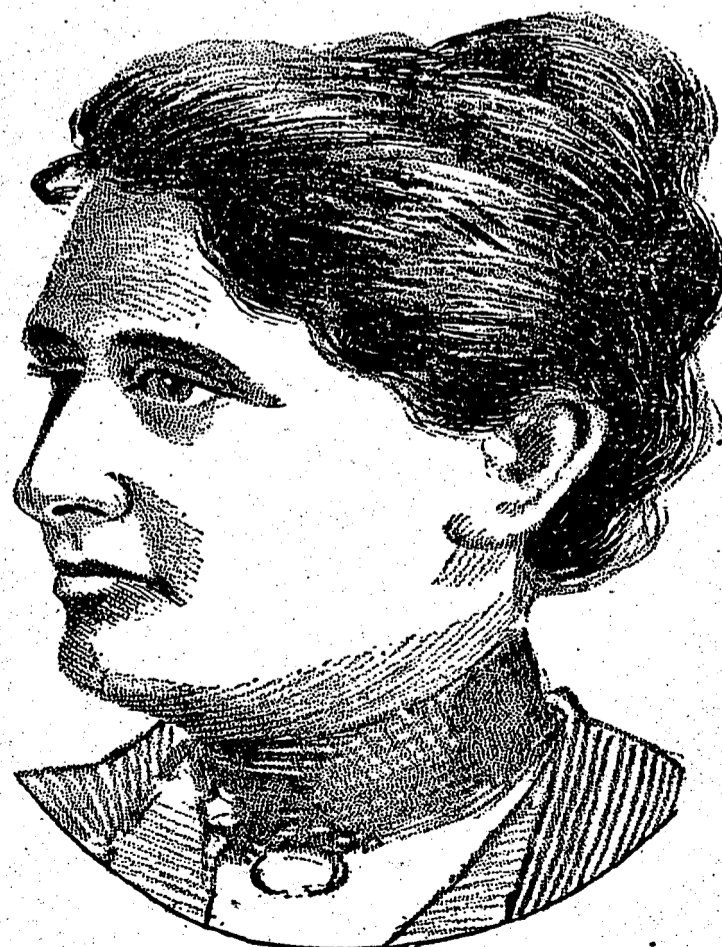
The Celebrated Medium, Mrs. Leonora E. Piper.