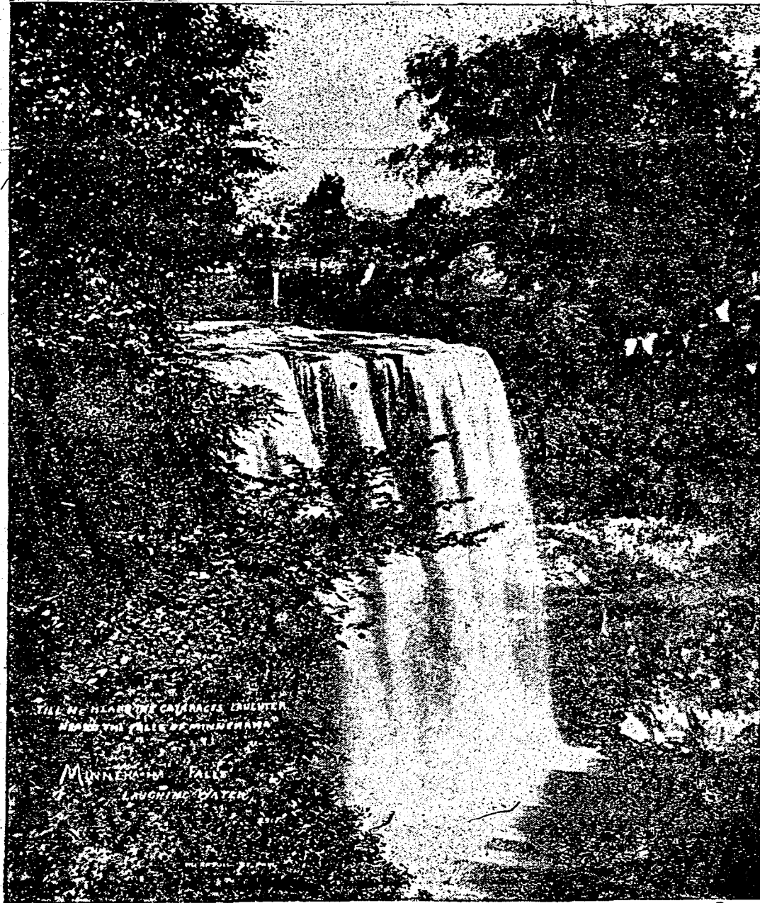
Minnehaha Falls, Minnesota.

Extract from a Lecture Delivered in Chicago, Nov. 25, 1900.