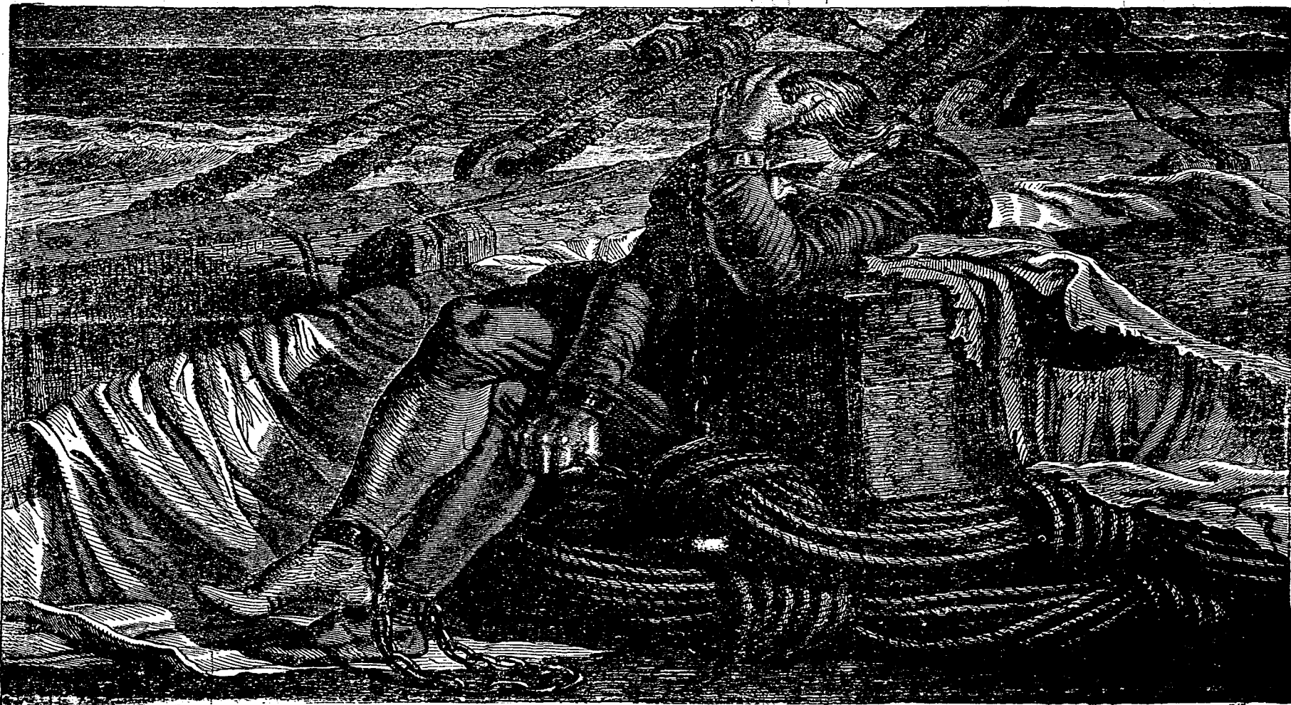
Christopher Columbus in Chains on Board His Ship—the Gorda

But see what men are doing with their minds. They are still giving them into the keeping of the "self-appointed vicegerents of God"; and for what purpose? Is it to be developed that they do this? Indeed, no; for the "self-appointed" do not develop the minds committed to their keeping; on the other hand, they press them all into