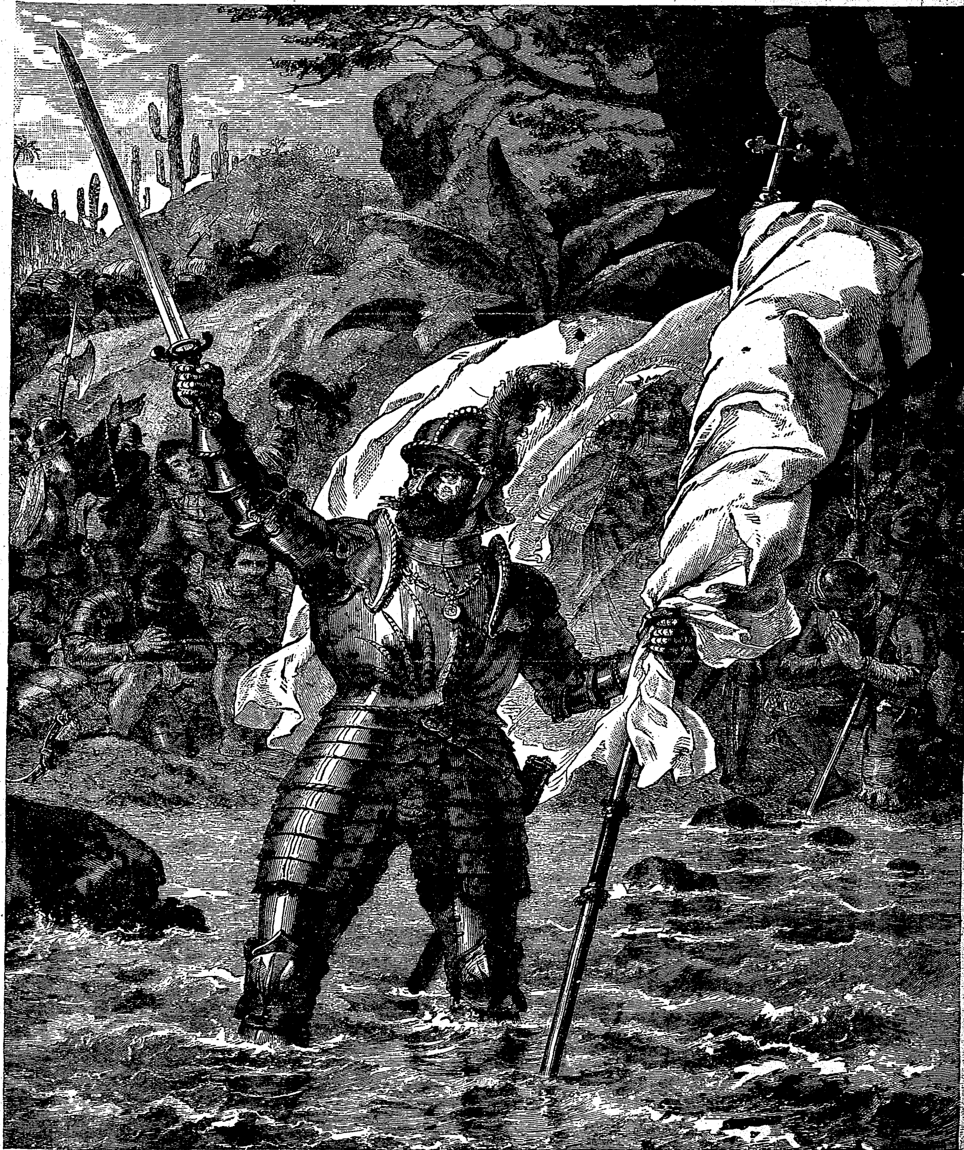
Balboa Taking Possession of the Pacific Ocean.