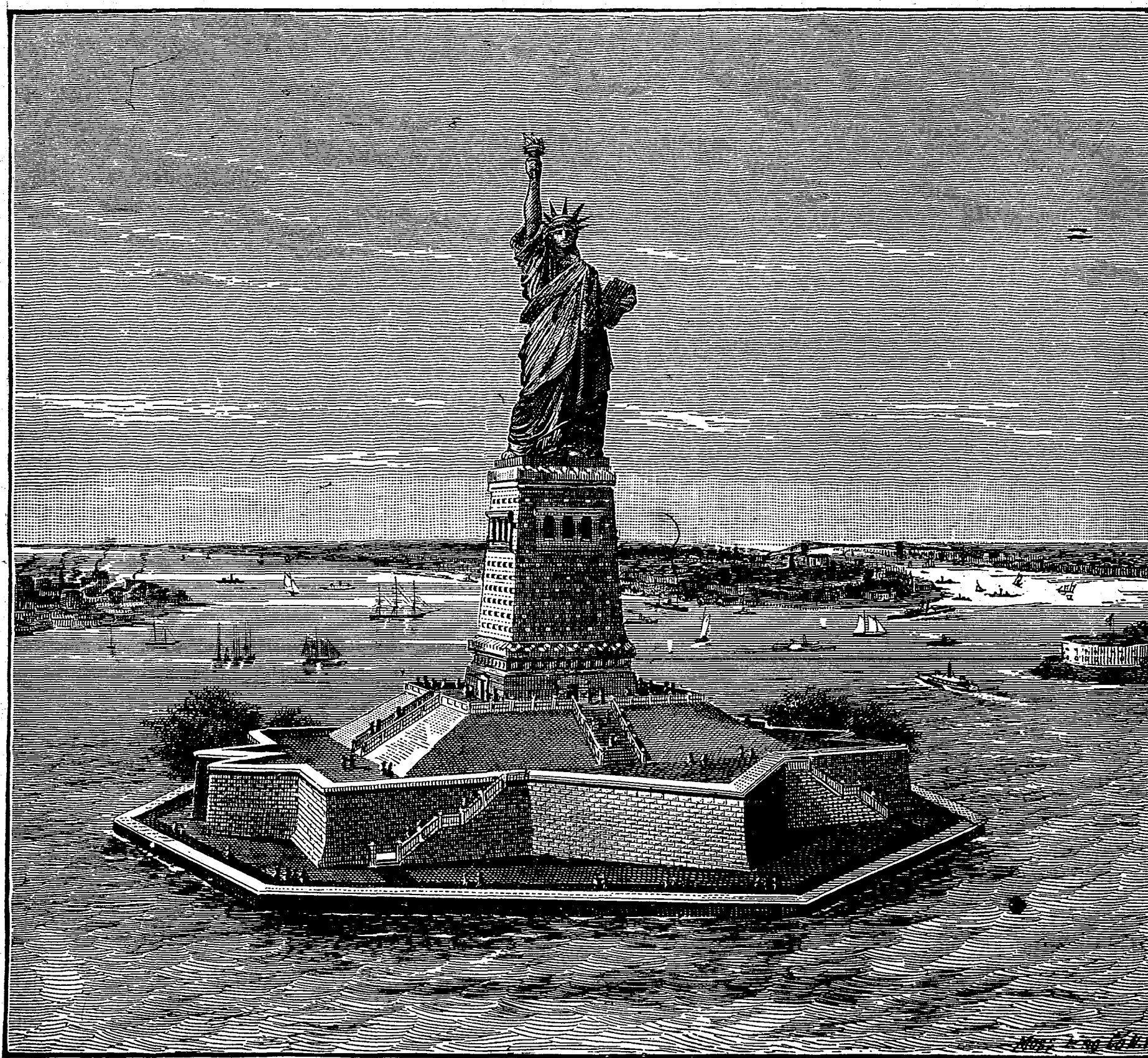
BARTHOLDI STATUE—IN NEW YORK HARBOR—“LIBERTY ENLIGHTENING THE WORLD.”