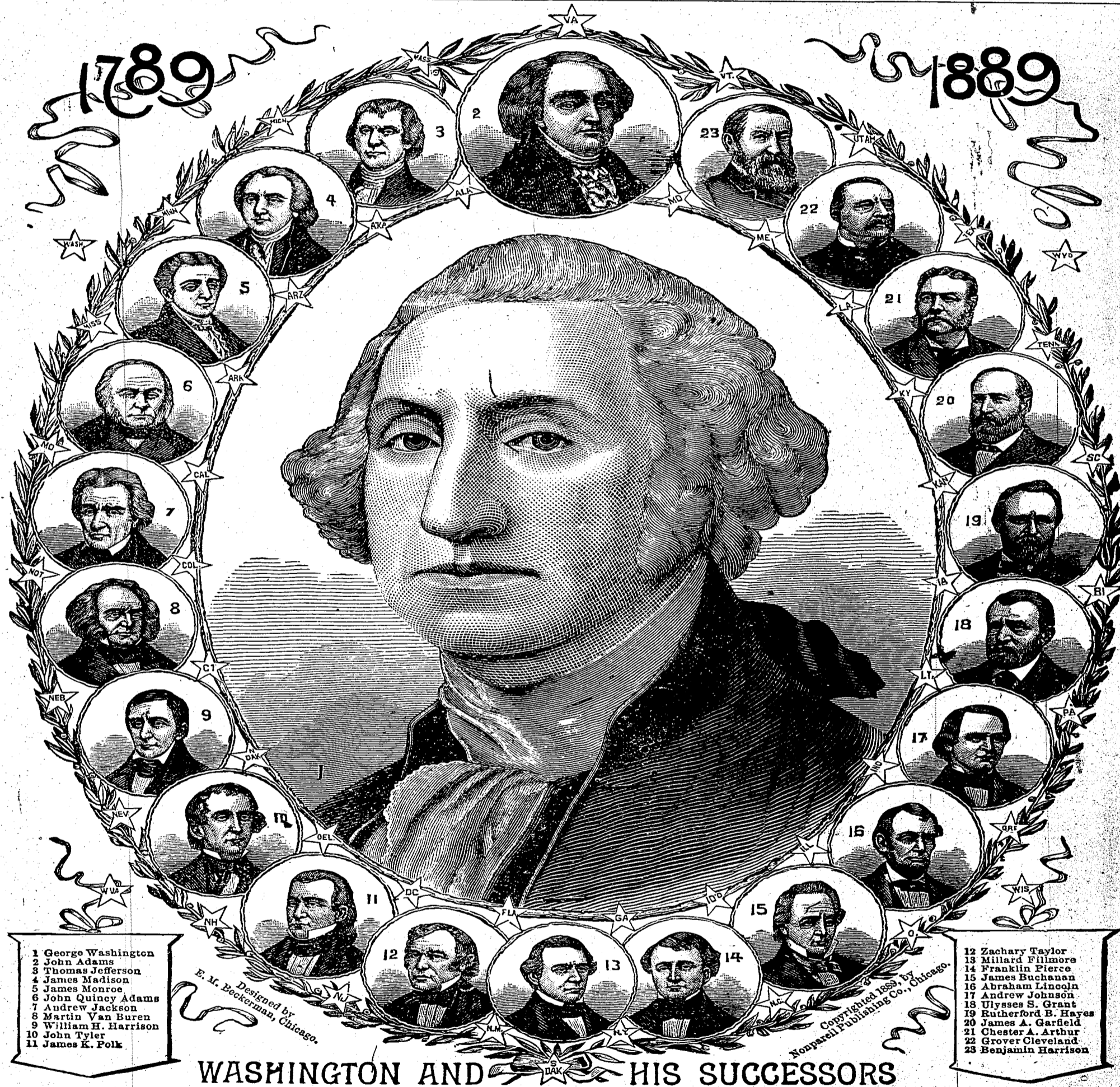
WASHINGTON AND HIS SUCCESSORS

There is really only one bit of definite knowledge on the subject—that is the working of the system of native post of India. It is called by the Brahmans Dak and was established centuries ago by the Matajans, or native traders, for secret, political and commercial news. At present its special use is chiefly for heavy speculations in opium. It is conducted by runners,