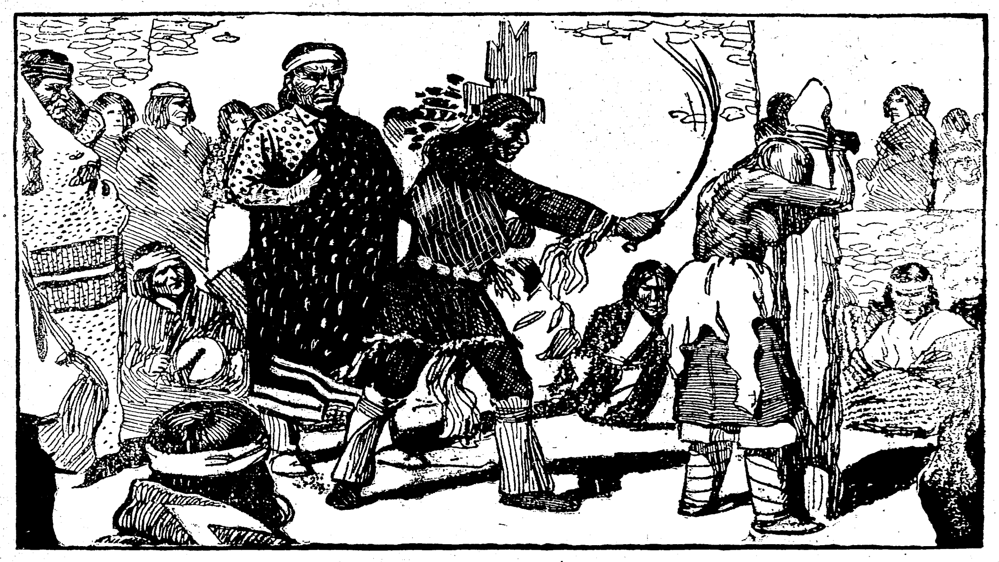
An Old Woman accused of being a Witch, being tortured before the High Priest of the Zuni.

The Zuni people were aroused several months ago by the declaration of their priests that a witch dwelt among them. The witch was seized and tortured, and would perhaps have suffered an awful death had not the appeal of the Indian agent been heard at Washington. As a result, a squad-