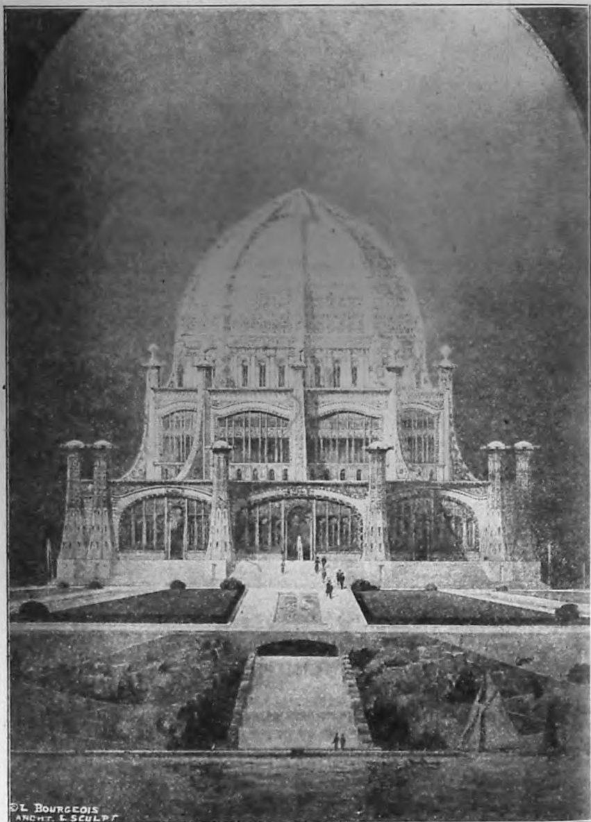
MASHRAK-EL ASKAR. (Universal Temple).