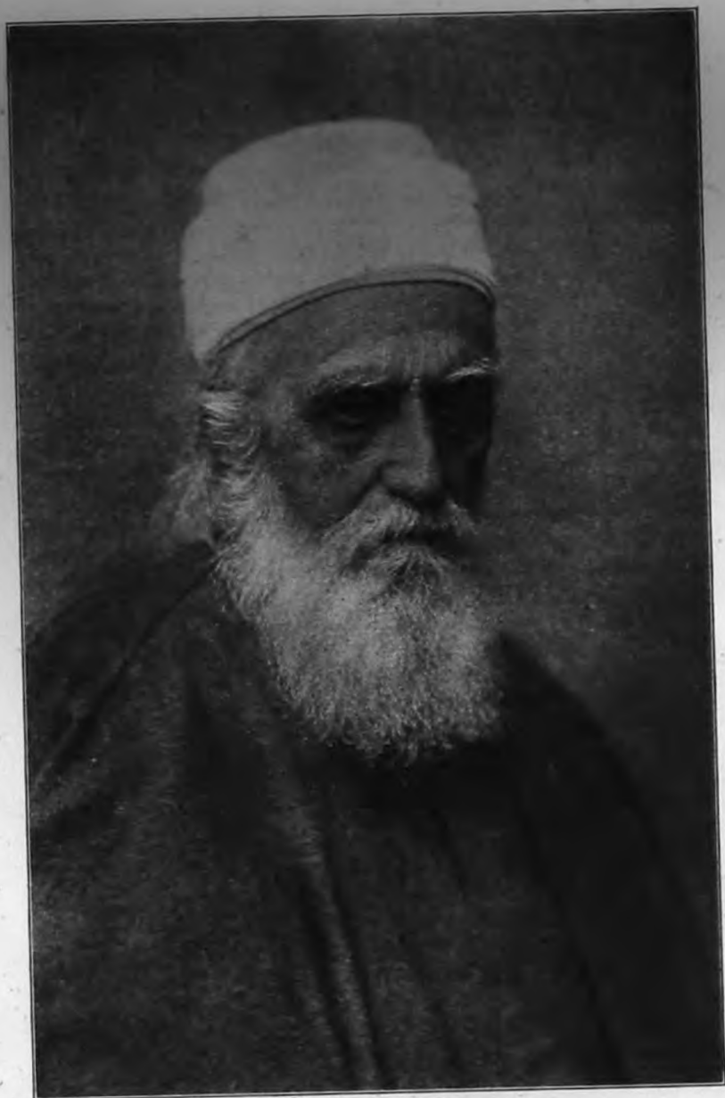
ABDUL BAHÁ THE SERVANT OF GOD