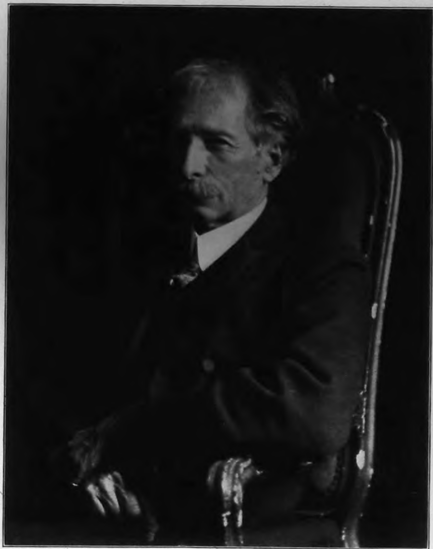
Louis Bourgeois architect of the Mashrak-El-Azkar or Universal Temple.