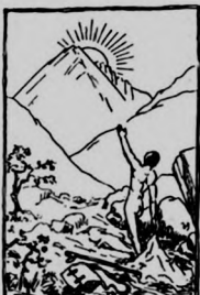
A Day's Work on Every Day, And the Reward is

Famous New York and Boston Sculptress, to whom one of the poems is dedicated.