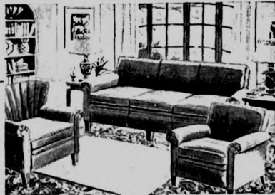
Comfortable, beautiful home furnishings at