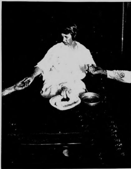
"This Picture Copyrighted"

★ Published by DALE NEWS, Inc., Lily Dale, N. Y., U. S. A. ★ SEMI-MONTHLY ★ JUNE 10th, 1942 ★ 10 CENTS