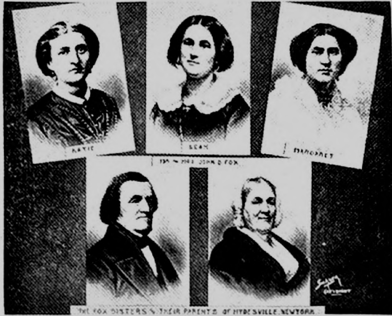
THE FOX SISTERS & THEIR PARENTS OF HYDESVILLE, NEW YORK