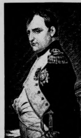
"Psychic Observer" NAPOLEON BONAPARTE