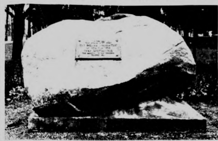
This immense rock was dedicated, in 1937, as a memorial to the founders of CHESTERFIELD SPIRITUALIST CAMP at Chesterfield, Indiana. It is located at the end of the main Chesterfield thoroughfare, between The Lilly and The Sunflower Hotels ... directly in front of the beautiful park. The inscription reads: "Founded 1887. That Others May Know ... THE INDIANA ASSOCIATION OF SPIRITUALISTS, CAMP CHESTERFIELD; This Memorial To The Founders, Erected 1937." (Advertisement)