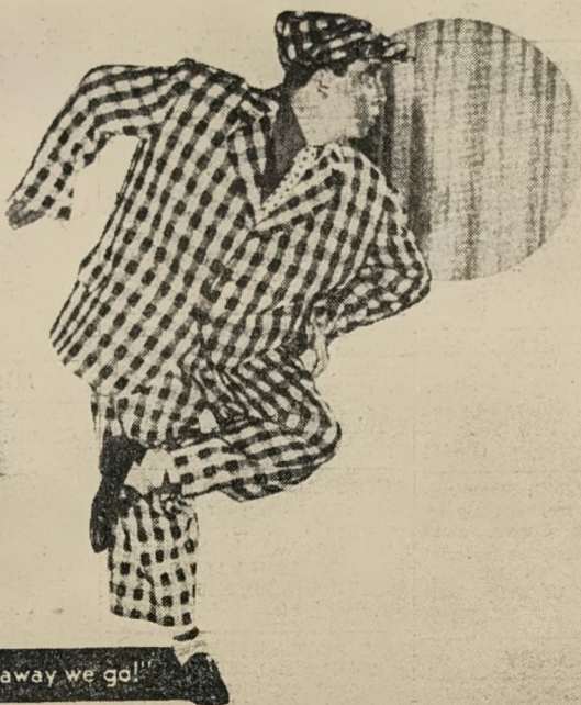
"And away we go!"