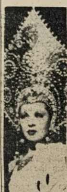
MAE WEST As Catherine The Great

Before the lights were turned off, Miss West told us of her personal revelation, experienced for some time past and how while writing her current play, heavily bearded faces kept appearing in front of her and that from time to time she sensed peculiar vibrations in the regions of the solar-plexus.