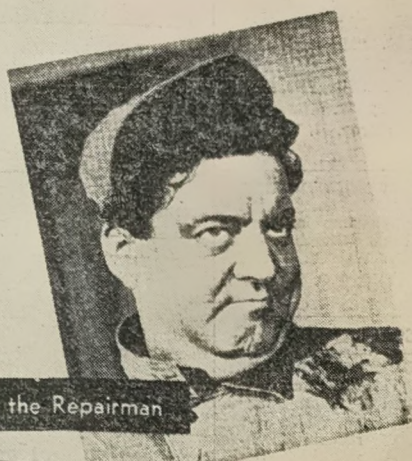
Rudy the Repairman