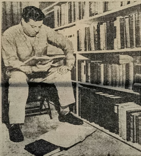
Scholar pores over his psychic library, which contains hundreds of volumes.

We show a few photos of the amiable Jackie Gleason in some of his characterizations known to TV-viewers throughout the country. Playing the buffoon, engaging in slapstick, Jackie still has a serious interest in psychic phenomena, which is shown by his 400-volume personal library of psychic books.