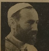
P. O. BOX 86

Why does everything go wrong for some people? If you are worried or ill and your prayers are not heard God might just as well not exist for you. If you want to come out of your troubles I will send you a free treatise that will amaze you and open the door for your help. Don't delay, write today. Send two 4-cent stamps for mailing in a plain sealed envelope.