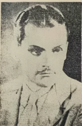
That's my father's voice," says James Cagney.