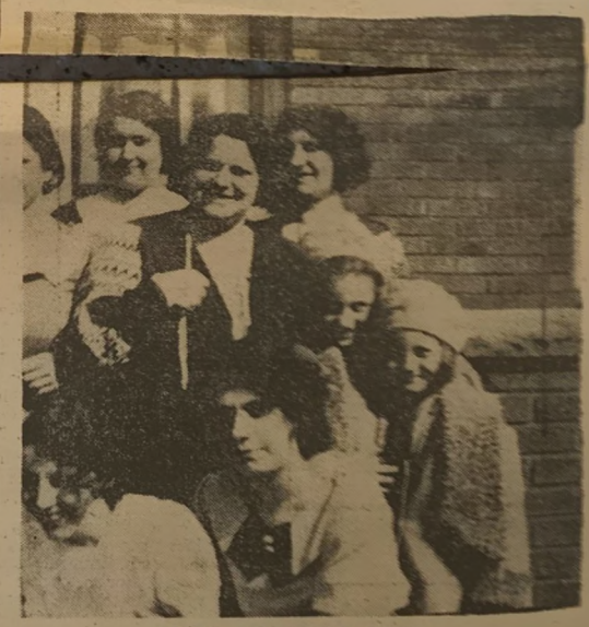
TOP ROW CENTER (in The Physical Body)