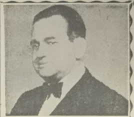
WILLIAM WALLACE Presents