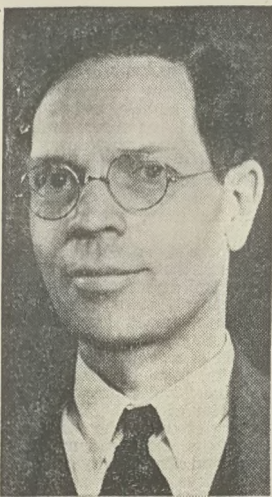
NOTED RESEARCHER — This eminent college professor, Gardner Murphy (above) is associated with the College of the City of New York, as head of the psychology department.

This happens time and time again throughout the history of psychic research. This research is entrusted, officially, to only top