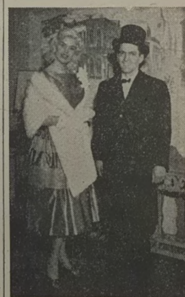
MISS CLAIRVOYANT FOR 1957