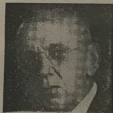
EDGAR CAYCE, Healer

SPECIAL NOTICE: Unarius — one year's Study Course — Now $20.00. We are happy to announce Unarius has obtained lithographing equipment, enabling us to now meet the great demand and offer Unarius teaching course at lower cost. Previously, the study course and Akashic Readings were obtainable as a single unit. Our new arrangement enables you to now secure the 13-lesson study course for just $20.00. Later on, should you desire the life analysis reading, it may be obtained singly. Time plan arrangements may be made when desired. This study can well be the fork in the road that may alter your entire future. You need be no exception.