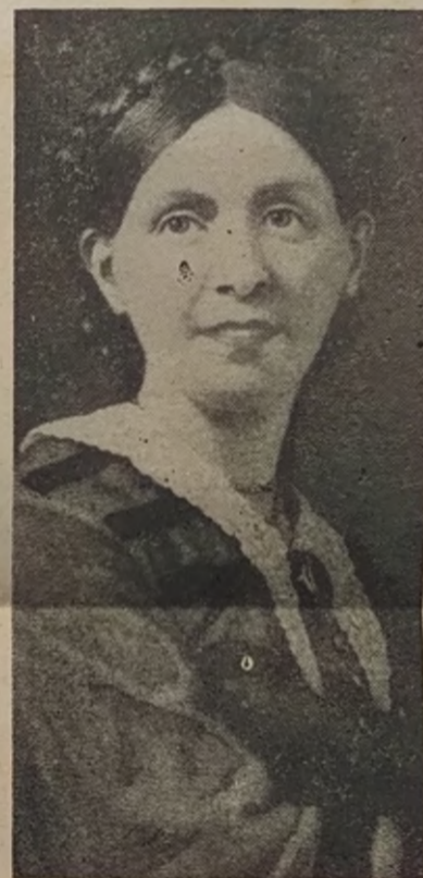
EMMA HARDINGE BRITTEN

"If our choice is dictated by love and wisdom, or by hatred and folly, we shall act accordingly, and register in our spiritual nature a stronger tendency to act the same way, and for the same reason, on all similar occasions. And in this way we shall become more—or less—fitted, spiritually, for our responsible task.