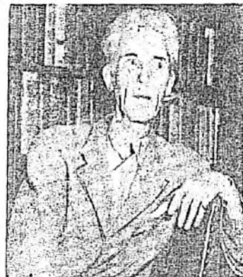
Dr. Hereward Carrington

It is a pity that the marvelous work done by this great psychic researcher has not stimulated his very soul but alas frustration permeates his very being so much so that he would turn against the mediums through whose instrumentality his life's work depended.—ED.