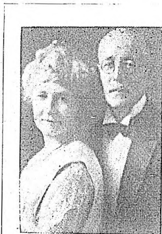
"The Wicklands" (*)

Such persons undoubtedly have established the sick habit