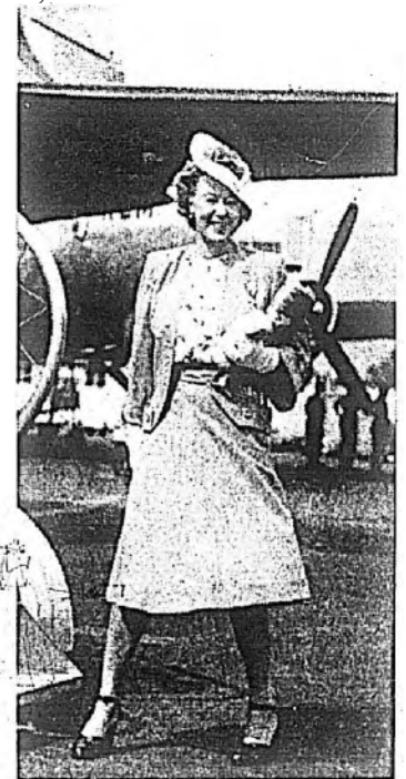
Grace Moore She sang an aria