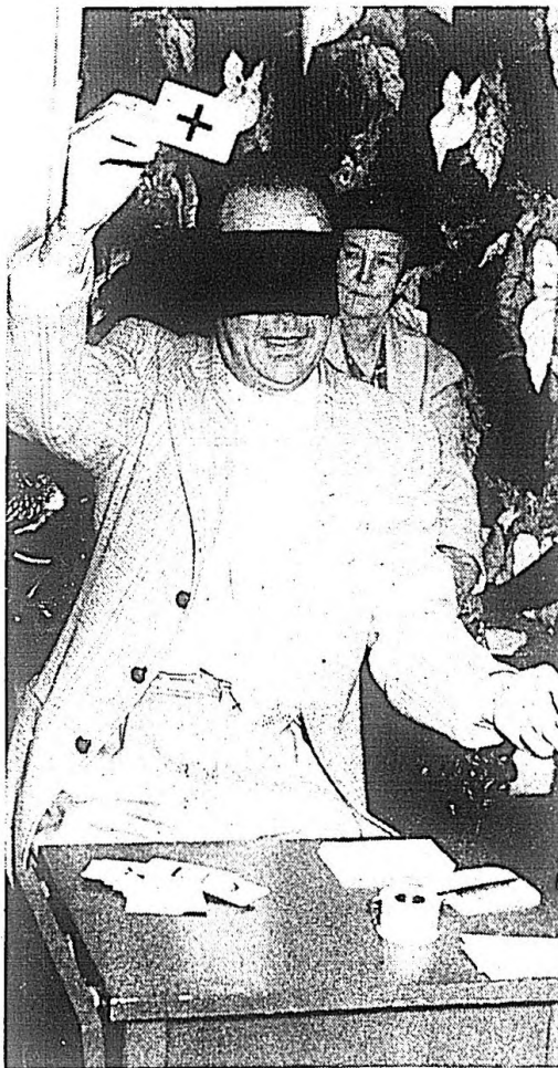
His eyes were taped. Can they ask more?