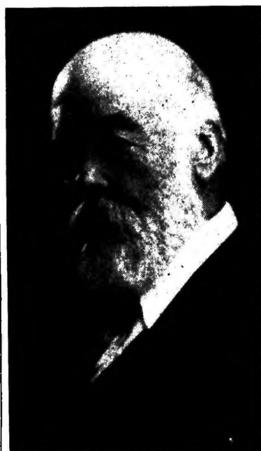
SIR OLIVER LODGE In His 88th Year

Congratulations to Sir Oliver Lodge, who celebrated his 88th birthday last month (June 1th), at his beautiful country home, near Salisbury, England.