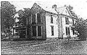
Spiritualist Church Parsonage