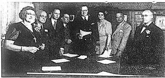
The picture above was taken at The Brookings Memorial Spiritualist Church, Summer and Richmond Ave., Buffalo, N. Y., during the recent annual convention of The International General Assembly of Spiritualists.

THEY DIRECT INTERNATIONAL GENERAL ASSEMBLY OF SPIRITUALISTS