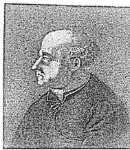
Psychic Observer PARACELSUS "Founder of Modern Medicine"

authorities by his unorthodox practices and theories, which were entirely free from medical tradition. On one famous occasion, he preceded a lecture by publicly burning the works of Galen and Avicenna, who were revered as the traditional cornerstones of recognized medical authority.