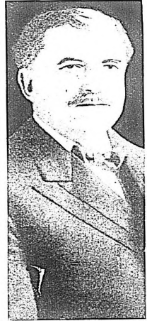
Russell H. Conwell

This noted clergyman of world-wide fame, was minister of The Baptist Temple, Philadelphia, Pennsylvania. He was born in a modest country home-stead near South Worthington, Massachusetts, February 15th, 1843.