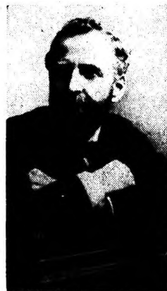
W. T. STEAD

A guide to successful spirit communication, embracing instruction for the beginner, hints for the advanced student and authentic, practical information for the sincere worker.