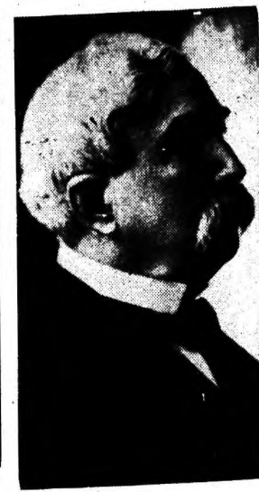
Psychic Observer THOMSON JAY HUDSON

He is the author of one of the greatest classics in the field of Spiritualism... the book "The Law of Psychic Phenomena," a working hypothesis for the systematic study of Hypnotism, Spiritism and Mental Therapeutics. (Dale News, Inc.—used copies, $1.50).