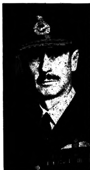
SIR HUGH DOWDING

He Led the Fighter Command During the Battle of Britain