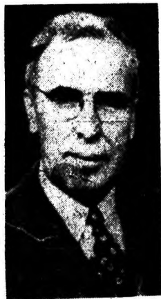
Psychic Observer CHARLES G. SMITH President of National Spiritualist Association

This decision by Magistrate McGee , following the Court of Appeals decision, is a hopeful sign that other lower courts will take the same attitude and thus make it impossible for public authorities to continue to interfere with the belief, practices or usages of incorporated ecclesiastical governing bodies of the Spiritualist faith and the duly licensed teachers or ministers thereof acting in good faith and without personal fee.