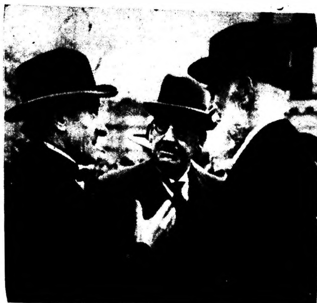
HANNEN SWAFFER, "The Pope of Fleet St." (left) talking to BERNARD SHAW, England's severest critic (right) on the curb in downtown London. On many occasions, Swaffer has discussed Spiritualism with Shaw—even offering to take him to seances but Shaw hides behind the "when you are dead you are dead" philosophy.

were not a professional singer, she could not afford to sing so well.