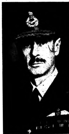
SIR HUGH DOWDING

He Led the Fighter Command During the Battle of Britain