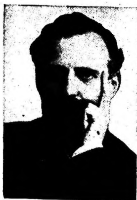
W. T. STEAD

DALE NEWS, INC., LILY DALE, N. Y., U. S. A.