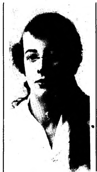
Psychic Observer KATHLEEN GOLIGHER

psychic rods exuded from the medium. That implied a form of materialisation.