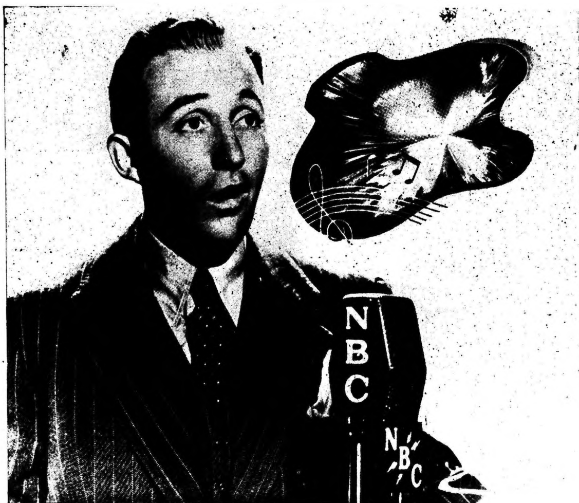
Bing Crosby sings while The Auratone interprets "Adeste Fidelis." The picture reproduced above, shows the final color pattern of "Adeste Fidelis" as sung by Bing Crosby and recorded through Auratone process of "Music in Color."

Music, Beauty and Sound Are Synchronized