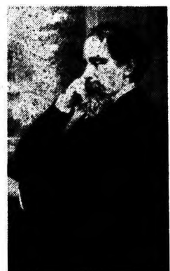
Psychic Observer CHARLES DICKENS

had decided leanings to the Occult world, he never gave it any profound study, probably because his interests and occupations were already overwhelming, even for his super-abundant energy. Nevertheless, he openly declared his belief in the truth of life after death, the force of destiny, hypnotism and its use as a healing power, and the fascination of astrology.