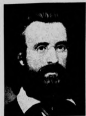
ANDREW JACKSON DAVIS He was the founder of The Lyceum Movement in the United States