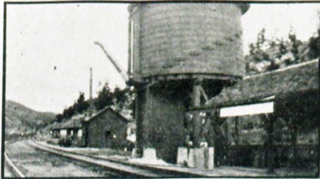
The Pine Cliff Station.

"I stand ready to deliver deed for the building site, absolutely free and clear of any incumbrances, at any time you wish it. Furthermore, in order to encourage the creation of a building fund for the Assembly Hall as mentioned above, I wish to start a subscription for you with $25.00, same being available to your order at any time you desire it. As a further help to the creation of this fund, I will pay a commission into the building fund of 10 per cent on any orders that may be received through you or your friends for lots in South Pine Cliff Subdivision.