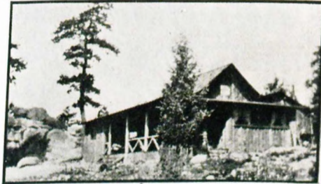
Built Upon the Rocks.

I can't tell you much about it this month. I have the plans—which I designed three years ago—so snugly put away that they are still reposing in some drawer or pigeon-hole. However, the cottage will have a large living room with a fire-place, a good-sized dining room and kitchen, and a comfortable porch. Such a cottage will probably cost about $150.00. The Assembly Hall will cost approximately the same. The plans for these will be given in late issues of POWER .