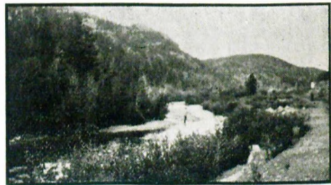
South Boulder Creek.

only good can return to them. From Colorado comes $5.00 and from Massachusetts comes this word: "I am enclosing $1.00, send me 'Spiritual Healing' (paper), and the balance may buy a few nails for your cottage." Thus at the time of this writing we have already received $10.70 toward our summer cottage. Proper acknowledgment will be made in POWER for all amounts received.