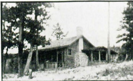
A Pine Cliff Summer Home.