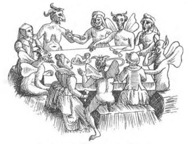
ASSEMBLY OF WITCHES AND DEVILS.