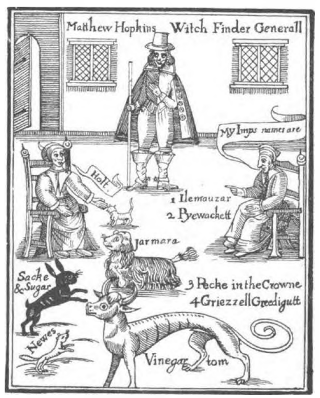
A WITCH'S CONFESSION,