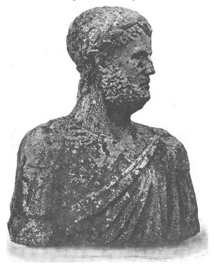
JULIAN THE APOSTATE. (After the Bust on Accrenza Catheiral, from a photograph by Dr. Salmon Reinach.)

Constantine as the State religion implied the negation of the saying of Christ, "My kingdom is not of this world." Already a most formidable organization, the Emperor must reckon with