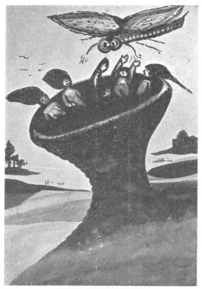
ELVES' NEST IN TOADSTOOL.

throughout a wandering and nomadic life. For a time he toured with theatrical companies. He has given public entertainments as a ventriloquist and character impersonator. As a draughtsman he is almost entirely self-taught. A favourite medium of his at one time was charcoal, but this he has now abandoned in favour of the brush. For two years he lived a gipsy life in