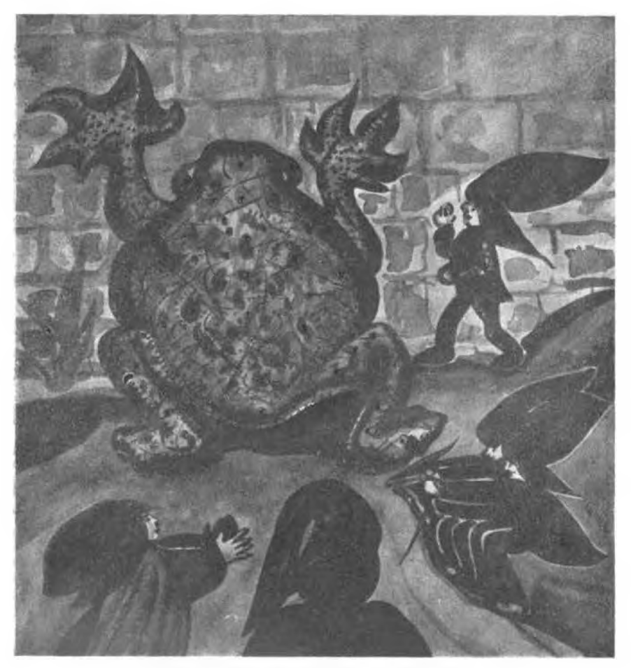
HUMAN FROG AND PSYCHIC ELVES.