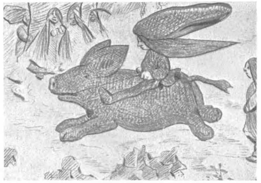
ELF ON PIG CHARGER.

more of the denizens of fairyland for a period of some thirty years. Now they appear to be his constant companions, and in fact some of the elves of the more mischievous type follow him about to his home, pull off his socks when he goes to bed, and occasionally indulge in the antics of the ordinary Poltergeist, hiding his possessions or moving them from place to place. His psychic experiences have been legion. During the period of his caravan life, on one occasion he heard a voice one day bidding him make the beds. As it was his companion's turn to do this part of the domestic work he took no notice of the voice, but on the admonition being repeated three or four times, he resolved at last to do what he was requested. On turning over the pillows