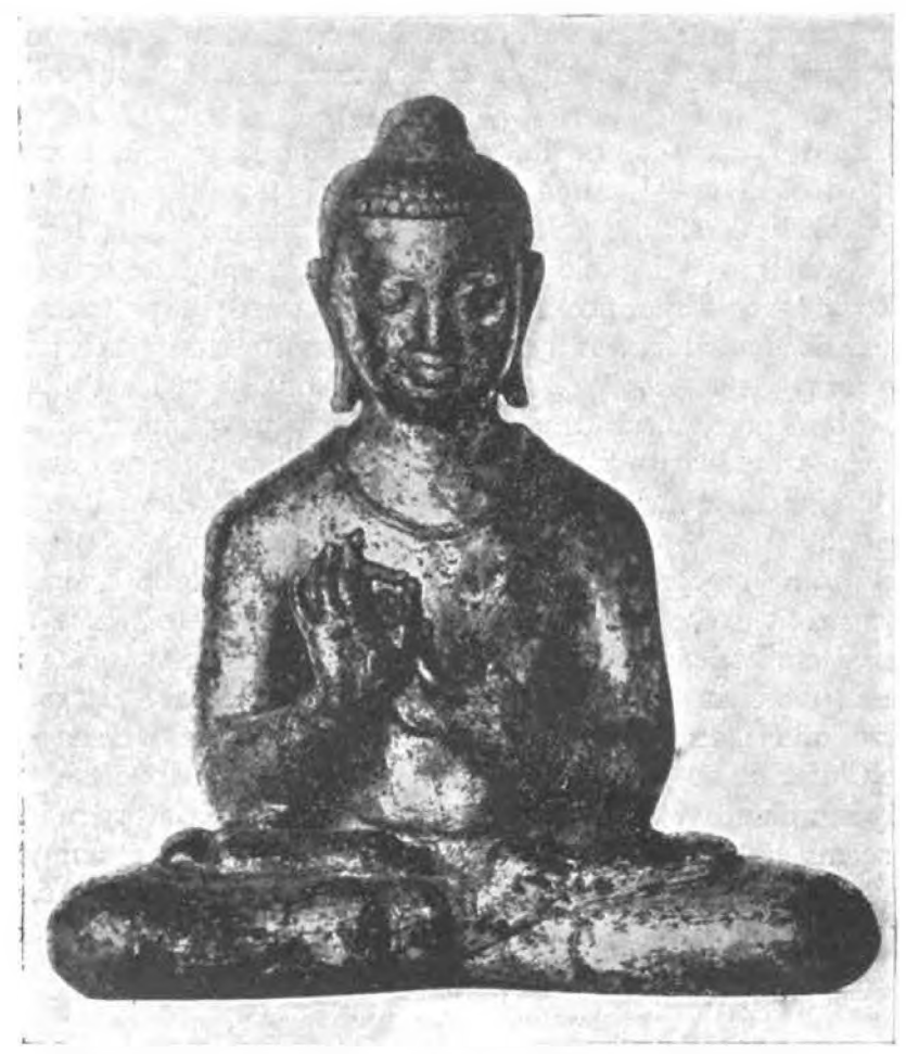
THE FIRST SERMON: "TURNING THE WHEEL OF THE LAW." Negative gilt copper, 8th-9th century a b. From Dr. A. Coemiraswamy's Collection.

who view physical death as a final psychic anæsthetic, Buddhism can be merely an altruistic Nay to the temptations which make succumbing men and women automatically effect the continuance of a morbid and pain-producing race, but from those who consider man as a will ignorantly submissive to laws of birth and reincarnation Buddhism deserves respectful study. It does not