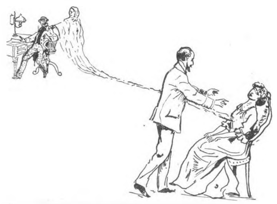
EXPERIMENTAL "SELF-PROJECTION" IN MAGNETIC TRANCE.

When you have progressed thus far, you must try to look around you, in your newly acquired "astral body," and notice