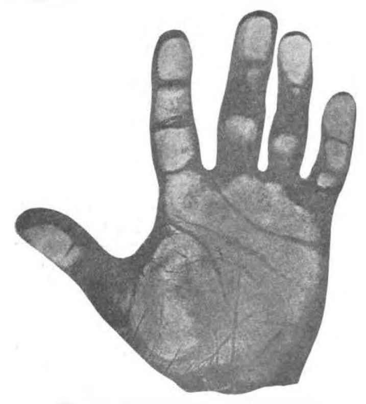
III,-THE HAND OF A LIVING "MOWGLL"

This impression of the right hand of a successful animal trainer and performer reveals a very strong, capable person, and denotes splendid powers of endurance, self-reliance and indifference to danger.