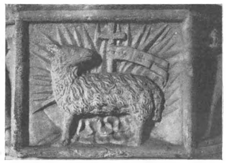
AGNUS DEL, SIXTEENTH CENTURY FONT, SOUTHFLEET, KENT.

It was a belief in the spiritual or moral significance of nature, similar to that of the mystical expositors of the Bible, that inspired the mediæval naturalists. The Bestiaries always conclude