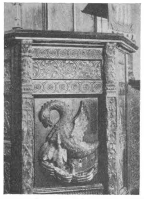
PELICAN IN HER PIETY, INSET IN PULPIT, ALDINGTON, KENT,

phant; and it has one long straight horn four feet in length." Its horn preserves one against poisoning. To capture the animal a chaste virgin bedecked with ornaments is set in the middle of a forest. As soon as the unicorn sees her, it comes and places its head in her lap and may then be easily captured. For this reason it was supposed to symbolise the Incarnation, the virgin typifying Mary, the unicorn's horn the unity of the Godhead, and the