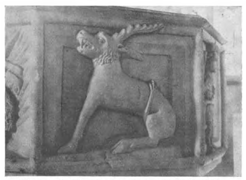
UNICORN, SIXTEENTH CENTURY FONT, SOUTHFLEET, KENT.

It may be questioned, however, whether the architects and preachers of the Middle Ages altogether believed in the strange