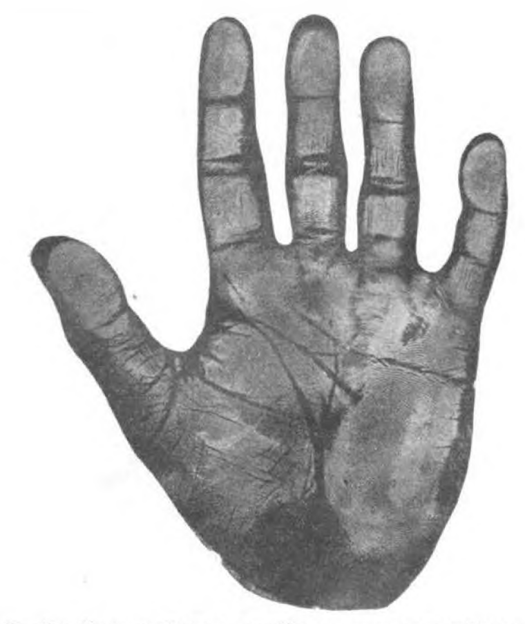
II .- THE HAND OF GIFFORD, THE WORLD'S MOST DARING CYCLIST.

His hand is small, thick, firm, compact and sparsely lined. These traits reveal great ambition, enormous energy, much combativeness, power of concentration, fearlessness and unimpressionability. The thumb is exceptionally strong, and proclaims an invincible will and dogged pertinacity. The fingers are set very evenly on the palm, the first three being of equal length and leaning towards the thumb. This is unique and testifies to a forceful