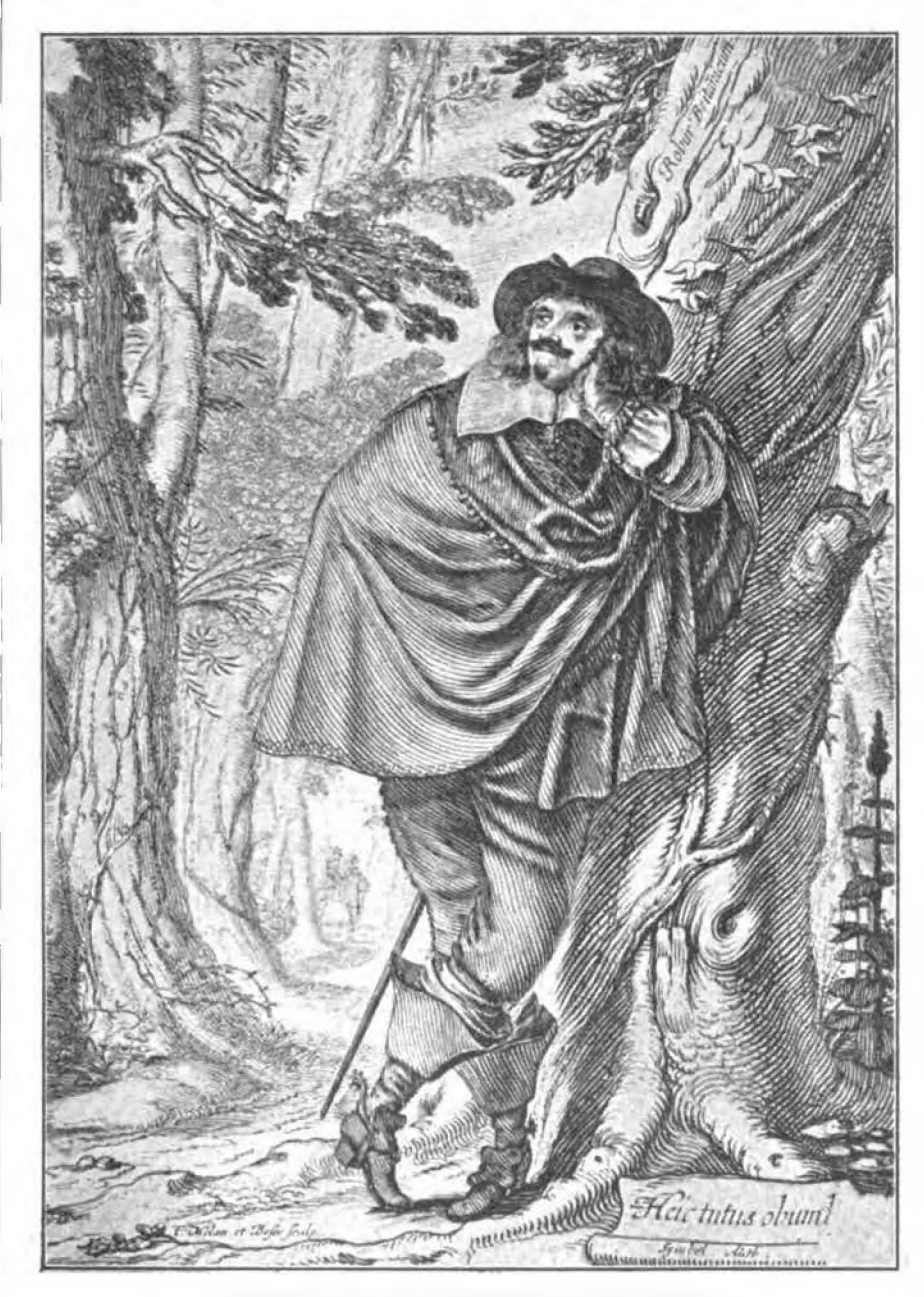
PORTRAIT OF JAMES HOWELL (1594?-1666). By Claude Melan and Abraham Bosse. (By permission of the British Museum. Photo by Donald Macbath, London.)