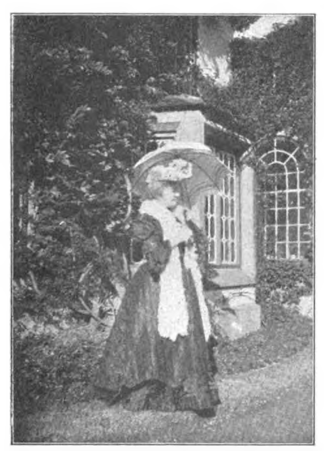
SMOKING-ROOM WINDOW, FACING HOLY WATER STOUP.

One day, however, I happened to mention it to a man of my acquaintance who is greatly interested in matters occult," and