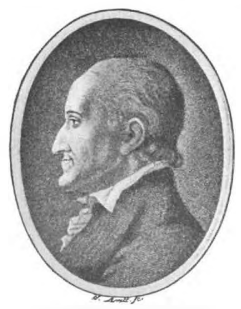
ADOLF FREIHERR VON KNIGGE.

I have given here an example of the grounds on which continental Masonry in the eighteenth century is supposed to have had political aspects and concerns in the worst sense of the expression. The connexion of the Illuminati with the older insti-