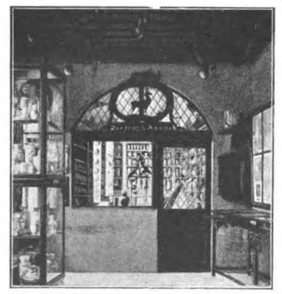
THE REPRODUCTION OF A SIXTEENTH-CENTURY PHARMACY IN THE GERMANIC MUSEUM AT NUREMBERG, (By courtesy of Messes, Macmillan & Co.)

argued, are of efficacy in the curing of disease, according as they possess one or more of these so-called fundamental properties, hotness, dryness, coldness and moistness, whereby it was considered that an excess of any humour might be counteracted; moreover, it was further assumed that four degrees of each property exist, and that only those drugs are of use in curing a disease which contain the necessary property or properties in the degree proportionate to that in which the opposite humour or humours are in excess in the patient's system.