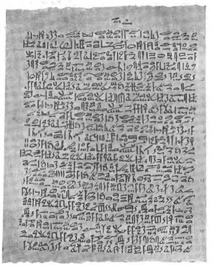
REDUCED FACSIMILE OF A PAGE OF THE PAPYRUS EBERS.

enhanced by a number of excellent illustrations in the text, including portraits of many famous men who have contributed to the building up of Pharmacy.