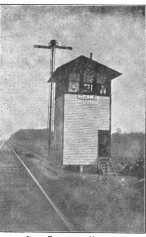
DALE TELEGRAPH TOWER.

The occurrences, which I am about to relate, have only just ceased. As soon as I heard of them I began an investigation, and while I was so unfortunate as not to witness the phenomena myself, I had the good fortune to interview the three young men who collectively witnessed them, and I personally visited the scene of the disturbance. With these three young men I am