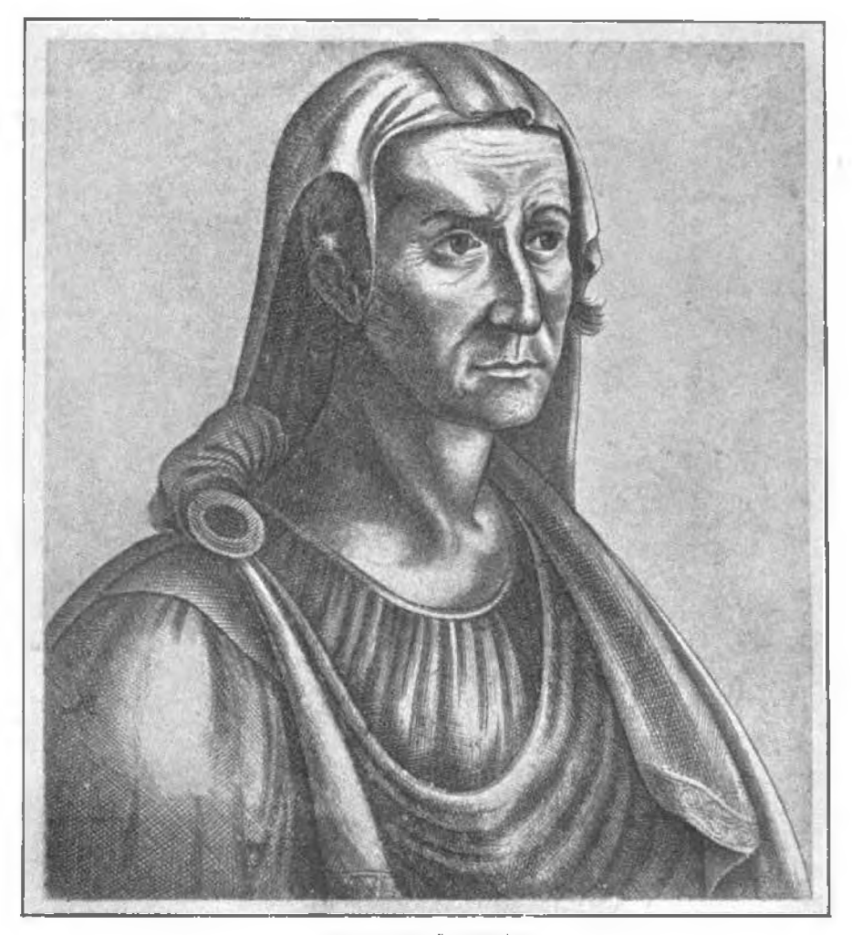
CLAUDIUS GALEN (?) (From an old Engraving in the possession of the Editor.)

which were regarded as related to (but not identical with) the four elements—fire, air, water, and earth,—being supposed to have characters similar to these. Thus, to bile, as to fire, were attributed the properties of hotness and dryness; to blood and air those of hotness and moistness; to phlegm and water those