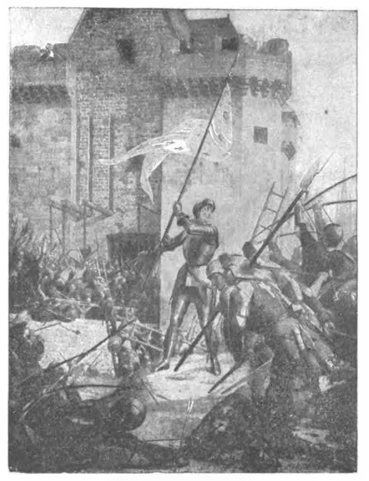
THE SIEGE OF ORLEANS.

for the incarnation of the Divine Feminine. Her character and her mission were adapted to the need of the hour, but they were not produced by it.