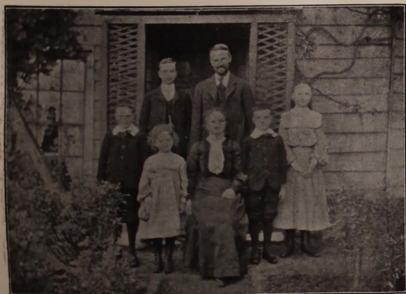
(FAMILY GROUP SHOWING OLD LADY'S FACE LOOKING OUT OF WINDOW OF EMPTY ROOM.)

I understand that the house was an old one, but I do not know if there is any tradition to explain the haunting. Perhaps I should add that I have shown the photograph to a number of people and I find that about two out of every three claim to see the old lady's face quite distinctly. About every third person