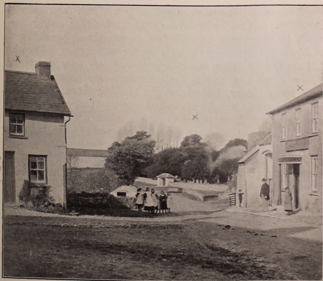
X POLICE STATION.