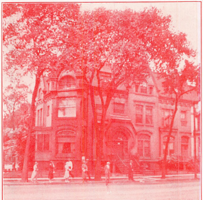
THE OCCULT DIGEST CENTER

Come and be instructed in these most vital questions of the hour.