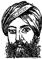
THE HINDU DEPT. TRADE MARK